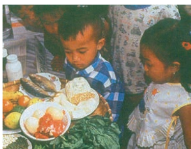
Providing nutritious food