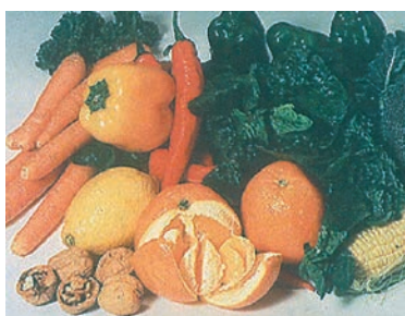
Yellow, green & orange fruits and vegetables are good source of Vitamin A