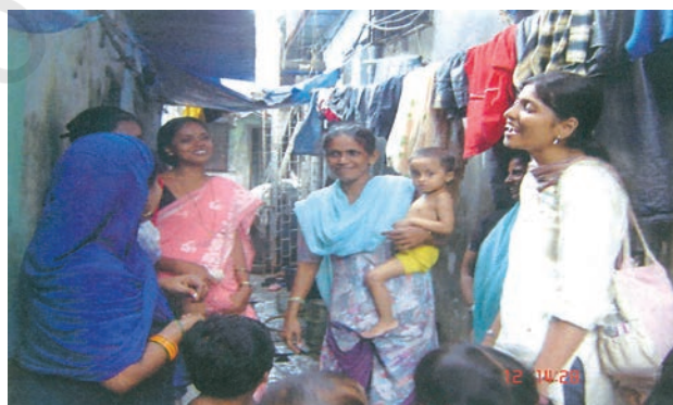
Counselling with mothers