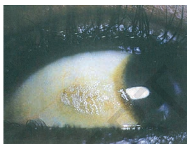
Vitamin A deficiency picture of eye