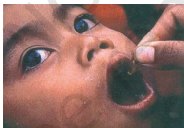
Iron and Folic acid drops