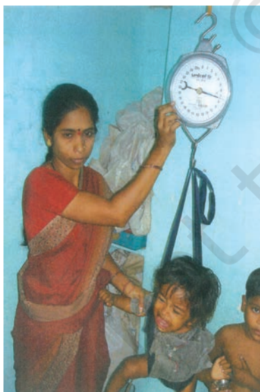
Weighing of a Child